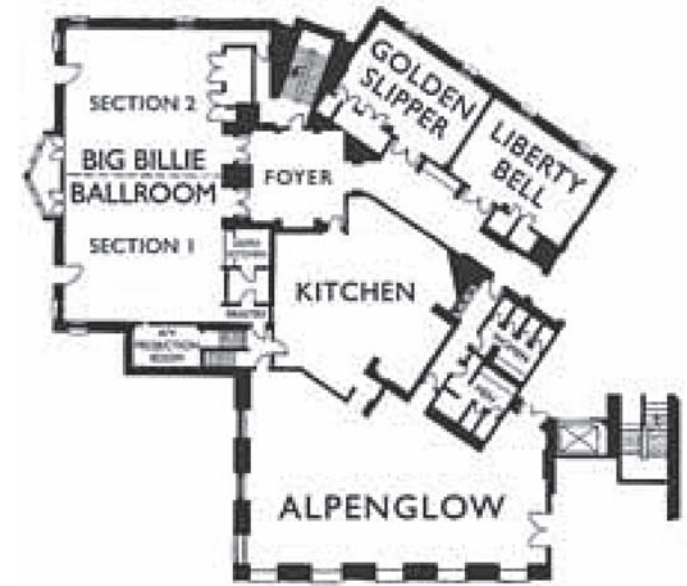
Resort Meeting Rooms